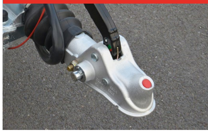
50mm ball coupling head with security lock