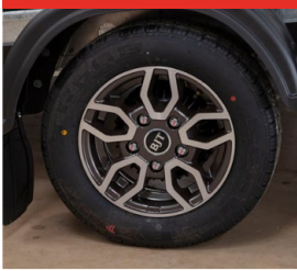
Alloy wheels The Car Hauler range is also available with B2 style alloy wheels in standard Silver or diamond cut Anthracite (Anthracite shown).