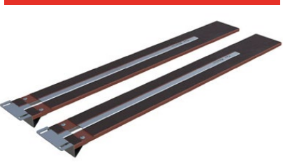
Assistor ramps provide a shallow loading angle for very low sports and racing cars and stow away conveniently inside the main ramps