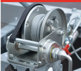
Manual winch Auto braked operation manual winch is fitted with steel wire rope and is guided through a set of rollers.